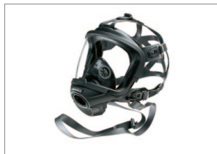
FPS 7000 full face mask range