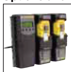
MicroDock II compatible