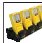
Multi-unit cradle charger